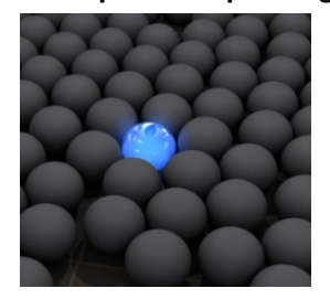
Figure 3: The Psychology of Being Unique

Principle 1: Expressing Your Uniqueness to Others - You want to express your thoughts, feelings, wants, and concerns to important people in your life. If you don't tell them, then they will have to guess, and they usually guess wrong. When they guess incorrectly, you get mad, hurt, anxious, etc.